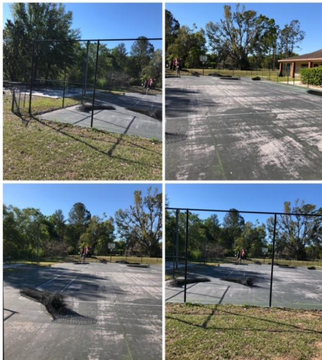
So excited that they are starting on our Play court cover! Watch for future work!