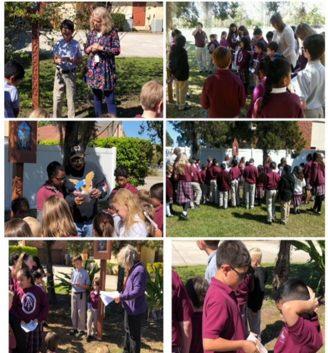
Outdoor Stations—Our students experience a different way to pray and get to work with other students. Even our parents joined in.